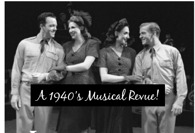
A 1940's Musical Revue!